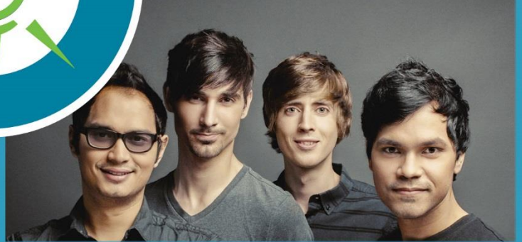
Musician:: Bread of Stone