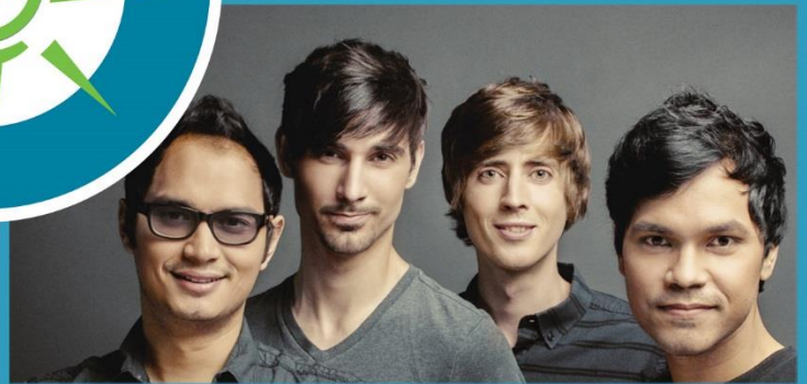
Musician: Bread of Stone