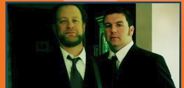
THE JUNKER GEORGES