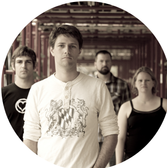
Musician 100 White Flags