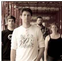
Worship Team 100 White Flags